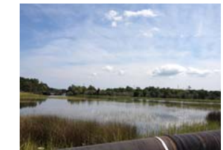
Noisette Creek, N. Charleston

acres are located along O'Hear Avenue and are adjacent to other Green-