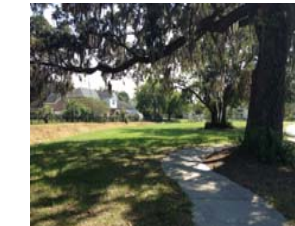
E. Enterprise Street, N. Chas.

belt properties that will be combined for a park along Noisette Creek, providing the public with passive park opportunities and access to the creek for fishing and crabbing.