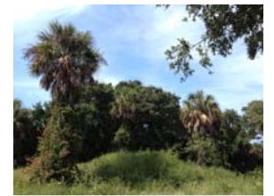
Live Oak Park, Isle of Palms

The City of Isle of Palms purchased a one acre parcel with their Greenbelt funding of $474,305. The property is located next to the Island Center shopping center and is easily accessible from the most heavily used beach area. The property is undevel-