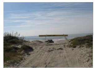
ADA Accessible Beach Walkover

(ADA) accessible beach walkover. This will be the fourth option for access to the beach by those with physical disabilities. In addition the city will provide two handicapped parking spaces at the site.