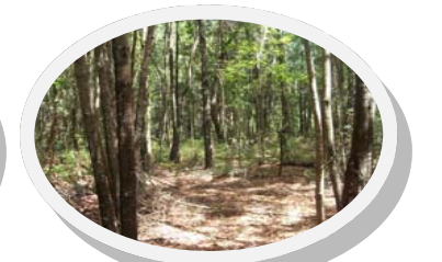
Fields Tract, Johns Island