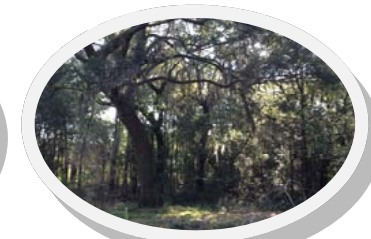
Edisto County Park Expansion