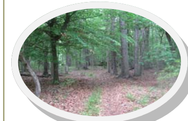
Clark Tract, Hollywood

Five Rural Greenbelt properties were funded for purchase during 2012. The projects represent 219 acres that will be open for public use. A brief description of each is on the back page.