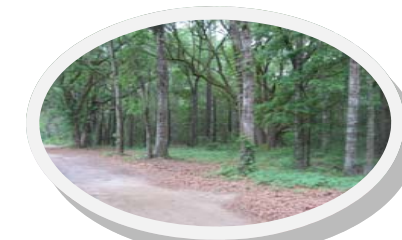
Katy Hill Road, Wadmalaw Island