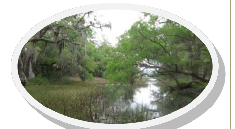
Rosebank Plantation, Wadmalaw Island

Rosebank Plantation, Wadmalaw Island - This 960-acre property lies within the 800,000 acres of the Cooper, Ashley, Wando, and Sea Islands (CAWS) Basin Focus Area featuring diverse ecosystems and a wealth of wildlife. Additionally, the property is adjacent to 423 acres of other protected lands. The public will benefit from the protection of scenic views along Rosebank Road and Maybank Highway, as well as Kitchen Hall Creek and Bohicket Creek. Being adjacent to 72 acres of Spartina marshland, tremendous public benefit is provided through protecting water quality, producing commercially and recreationally important species, and acting as a buffer to lessen storm surge impact.