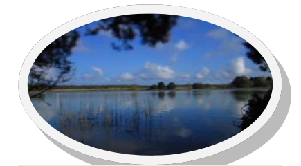
Papa's Island, McClellanville