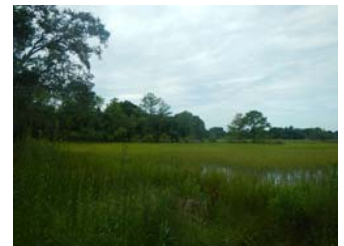
North Charleston's Birt Property

Filbin Creek, and other stand alone parcels that will be available to the public for parks and community garden areas.