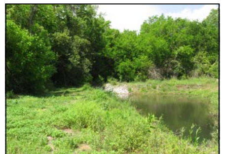
City of N. Charleston's East Dolphin Street project protected 14.4 acres of wetlands along Filbin Creek.