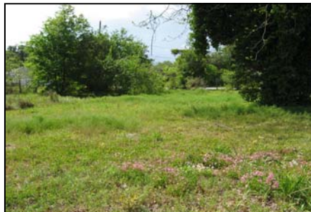
City of N. Charleston's North Carolina Avenue project provided 1/4 acre for a park in the Chicora Cherokee Neighborhood.