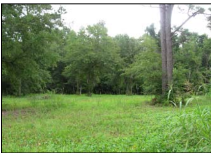
Community Action Group for Encouragement's project provided 2 acres for a park and trail near Jennie Moore Elementary School.