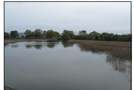
City of N. Charleston's two O'Hear Avenue projects protected 10.5 acres of wetlands along Noisette Creek.