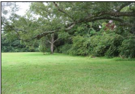
Town of James Island's Project provided 2.7 acres for a park and trail on Lighthouse Boulevard.