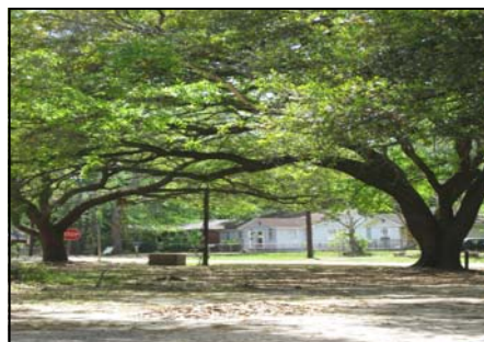
City of N. Charleston's Lambert Avenue Project provided 1/3 acre for a neighborhood park at the corner of Lambert and Justice Streets.